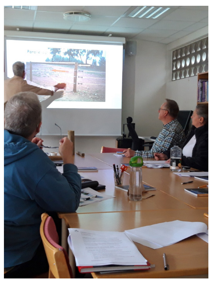
Fig. 5. A lecture for volunteers on predator-repellent fencing.