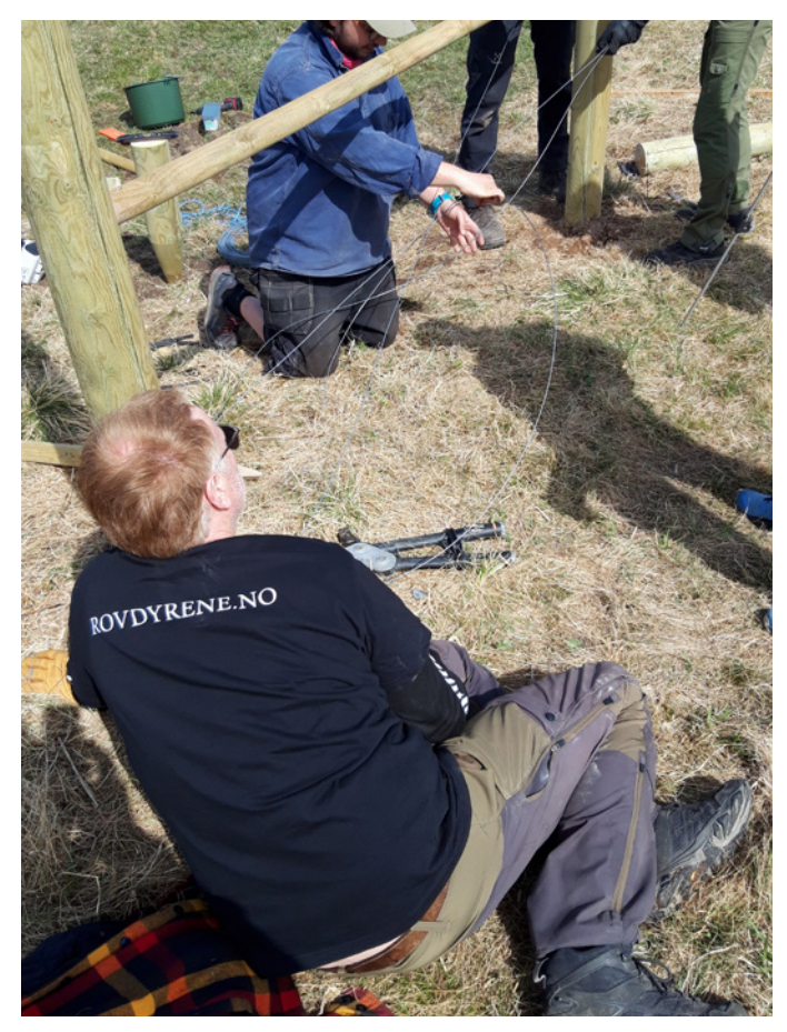
Fig. 4. Participants on a fencing course learning how to construct a parallelogram (Photo: Per Axell).