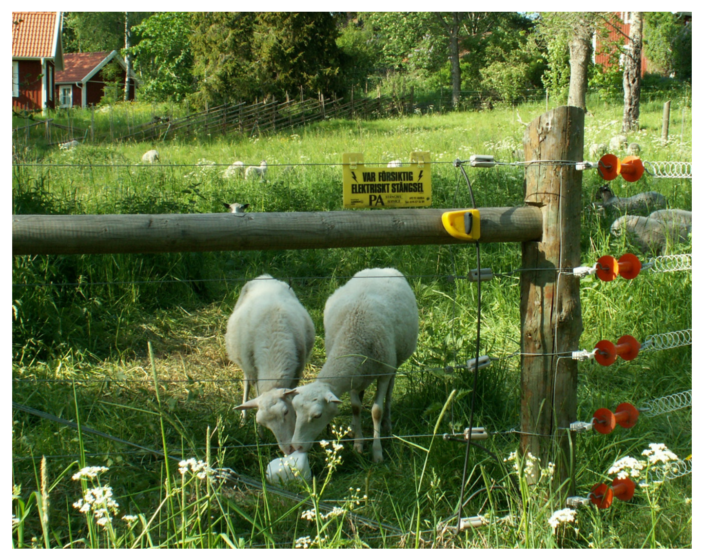
Fig. 2. Sheep protected with predator-repellent fencing.