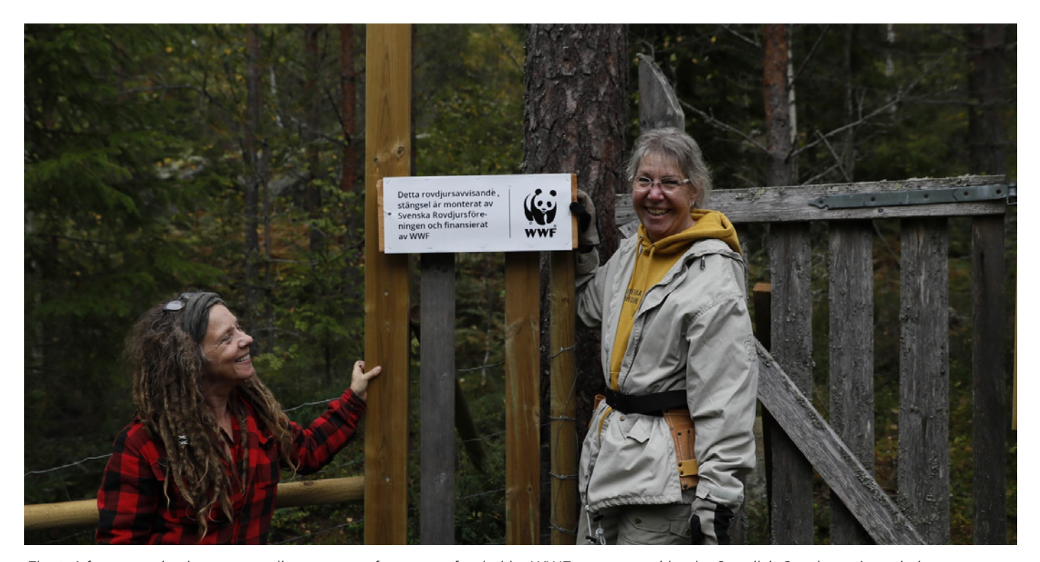
Fig. 6. A farmer and volunteer standing next to a fence part-funded by WWF, constructed by the Swedish Carnivore Association, at a reference farm.