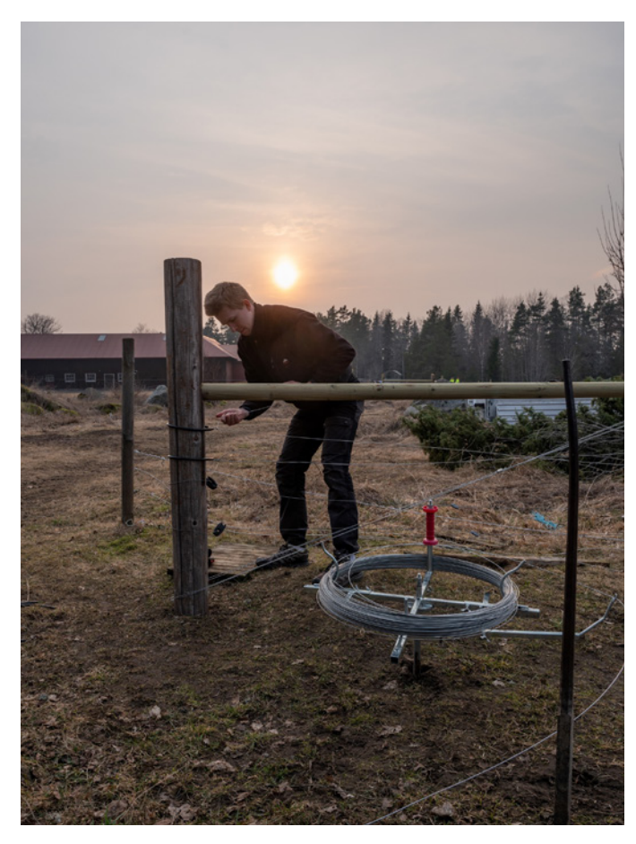
Fig. 3. Volunteers helping to build predator-repellent fencing.

under the bottom wire, to ensure the fence is fully operational. There is now a subsidy for this of 0.43 EUR per 5 metres, but a humid summer when the grass grows quickly can increase the workload. Grass cutting might be needed once during a dry, hot summer but once per month in a rainy summer. If a sheep net is used this step is avoided.